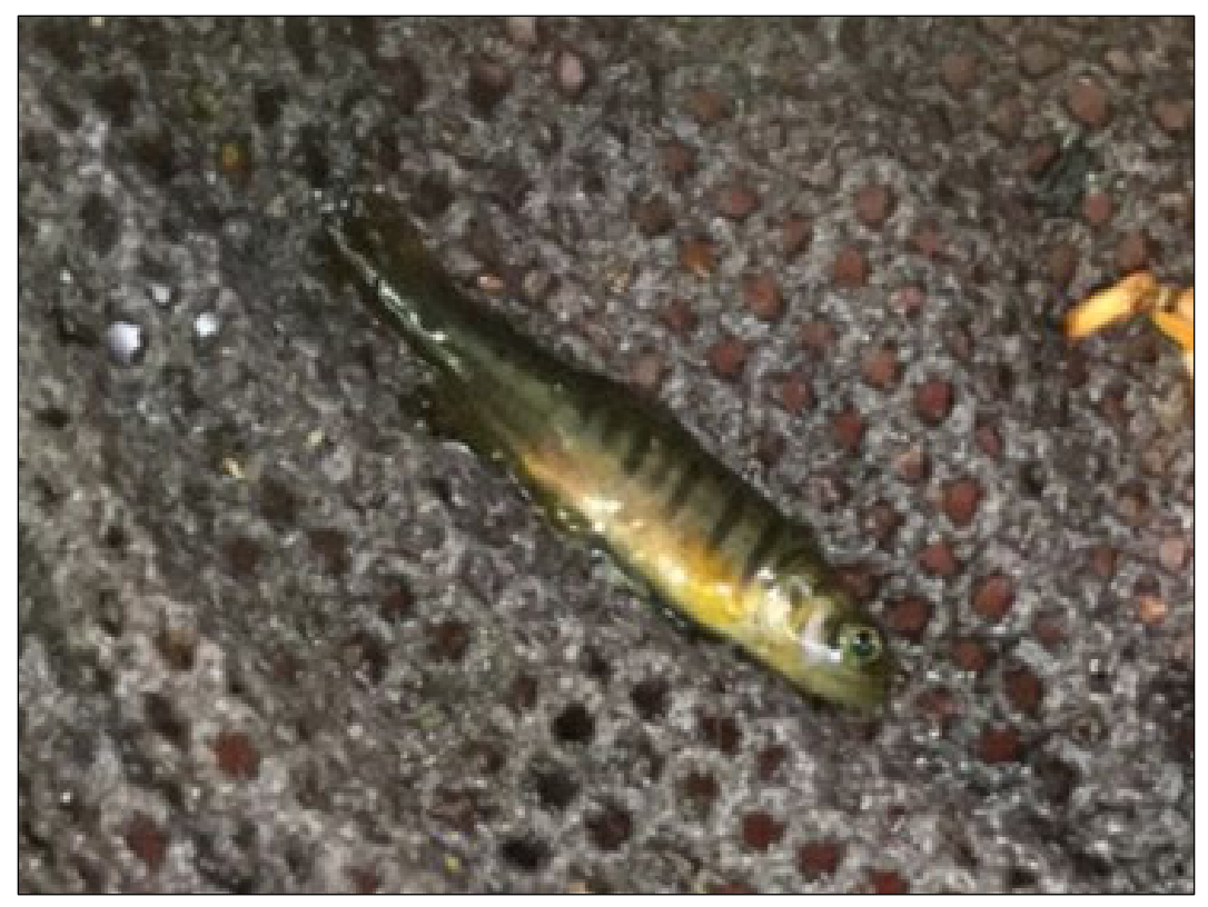
Figure 1.–Juvenile coho salmon captured at waypoint 1074.