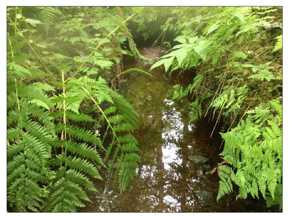
Figure 2.-Channel at waypoint 1074.